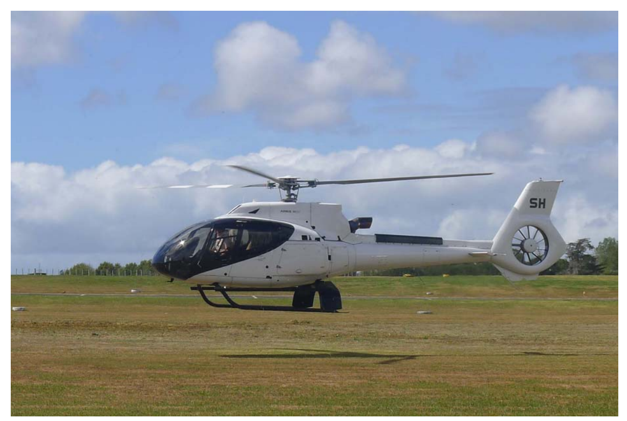
Figure 1. Air Bus H130T2

The Eurocopter 130 helicopter adopted for the original analysis is no longer used but has been replaced with an Air Bus H130T2 as shown on Figure 1. The Air Bus H130T2 is a newer version of the Eurocopter 130.